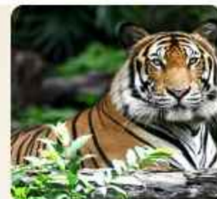
Nature & Wildlife

Read the full article at the following article: LINK