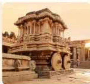
Cultural & Heritage